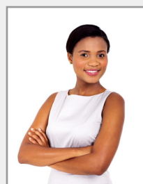
BLOUSE OR DRESS