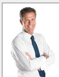
SHIRT & TIE